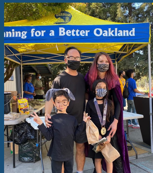
PHOTOS FROM RBO EAST BAY 510/ HALLOWEEN DRIVE-BY PICKUP EVENT